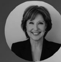
CHRISTY CLARK 35th Premier of B.C., Senior Advisor Bennett Jones