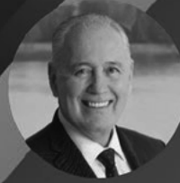
GLEN CLARK 31st Premier of B.C., Past President and COO, Pattison Group