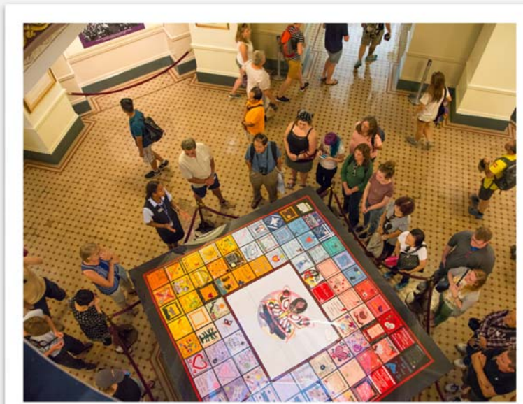
A quilt commemorating missing indigenous women and girls, on display summer 2016

In the year ahead, initiatives under way will advance the modernization of financial and administrative controls, and ensure that the Legislative Assembly is well prepared to deliver cost-effective activities and services to support the Assembly and its Members after the May 2017 provincial general election.