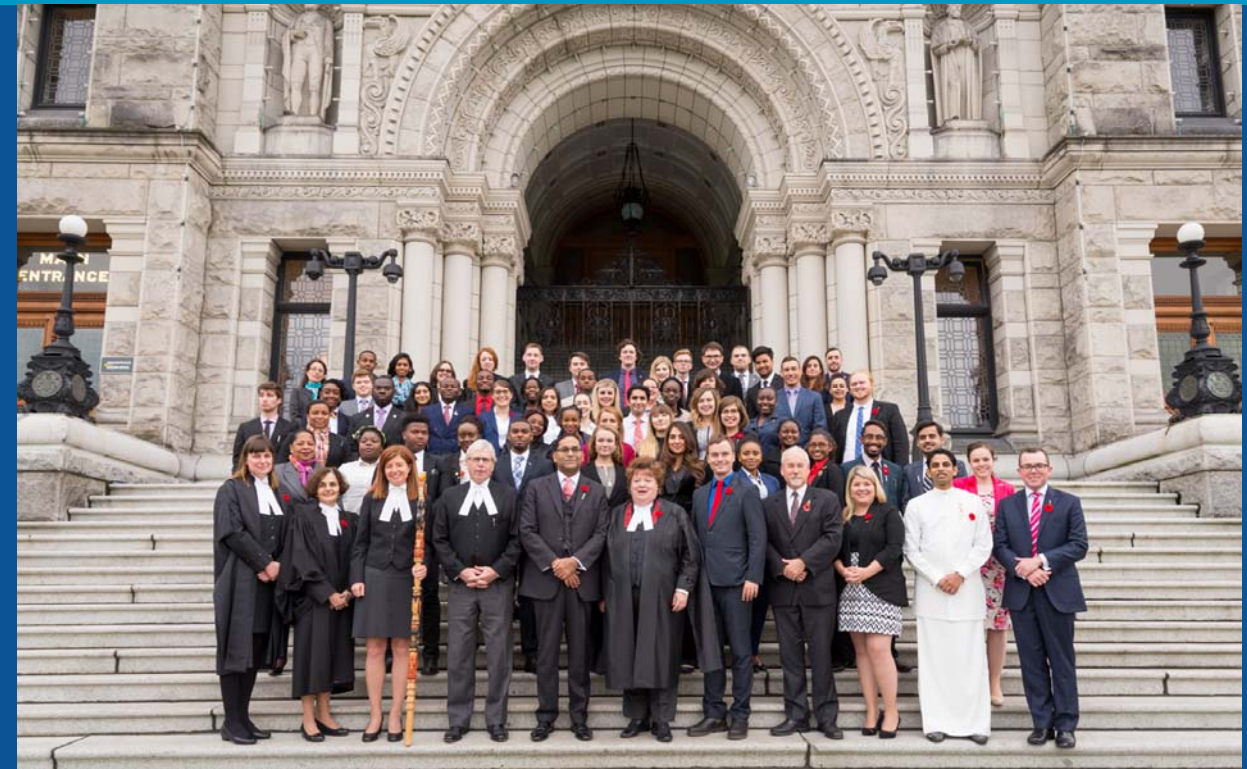
8th Commonwealth Youth Parliament delegates, November 2016